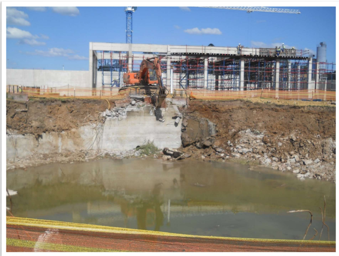
Figure 2 Demolition of old storage tanks - Darvil

Some of our biggest projects with WBHO included, Demolition earthworks at St Anne's Hospital, earthworks at Suncoast Casino in Durban and Hulamin in Pietermaritzburg. With Group Five, we completed earthworks, demolition, and bulk earthworks. We are also contracted to the Department of Transport for certain road construction projects. We have worked extensively on gravel roads, storm water drainage, concrete roads, layer work and asphalt. Over the years we have developed and maintained favourable relationships with our suppliers and clients.