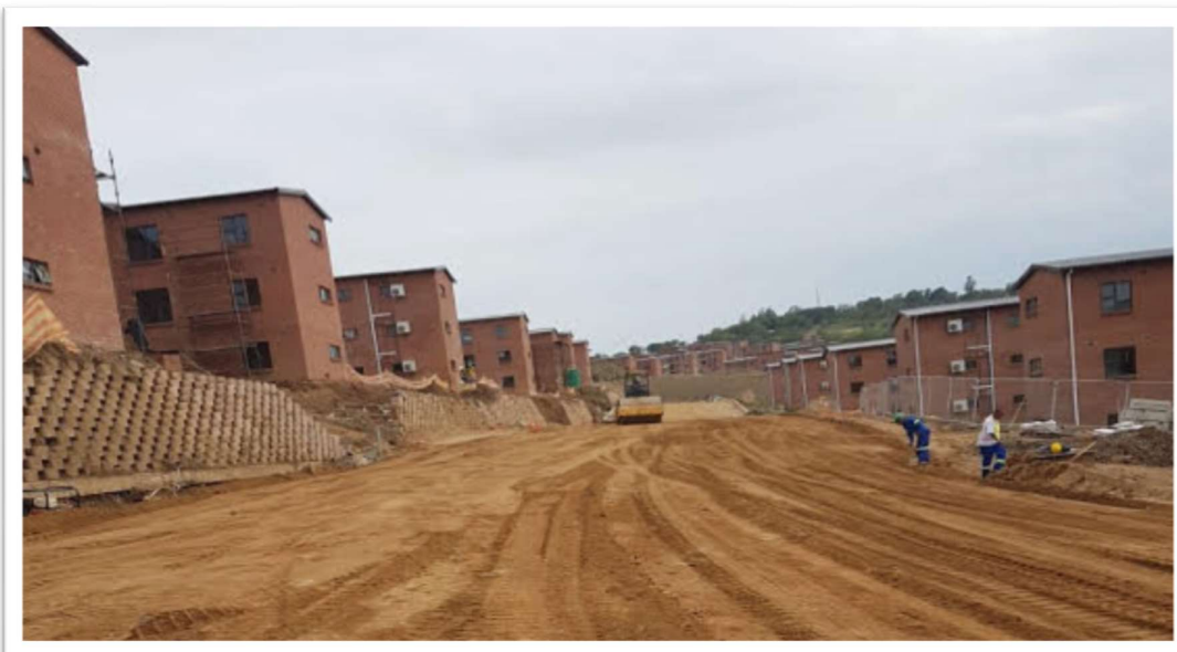
Figure 10 Layer works Westgate

Address: 26 Pentrich Road, Pietermaritzburg