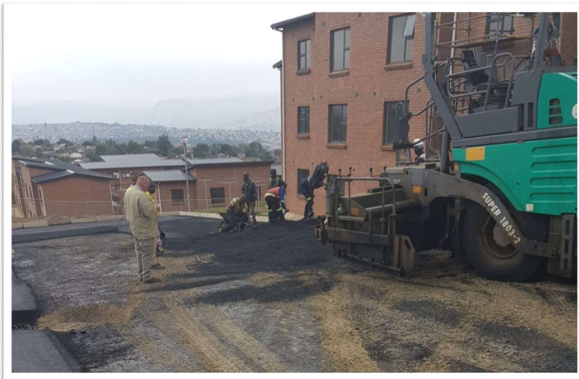
Figure 11 Asphalt Westgate