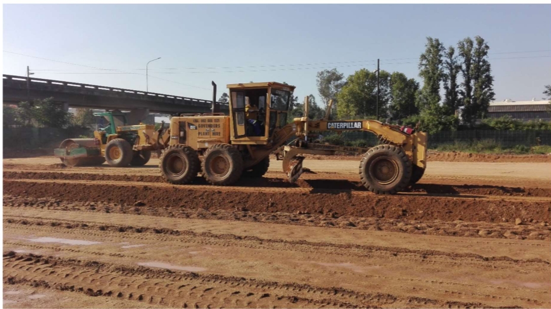
Figure 7 Final level grading at Jika Joe Housing

Address: 26 Pentrich Road, Pietermaritzburg