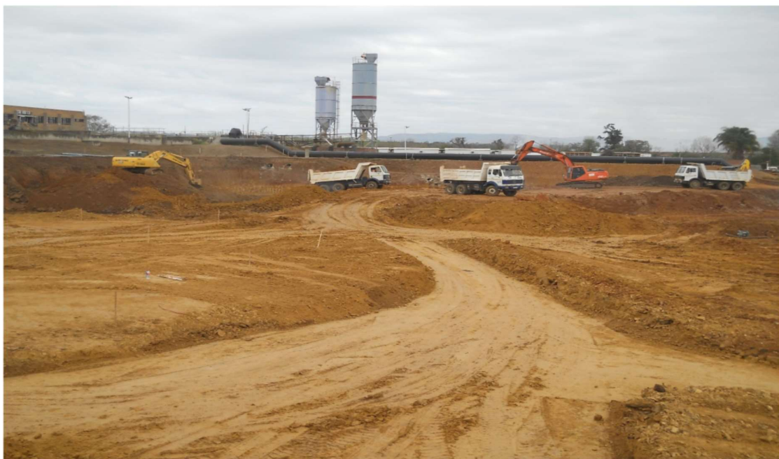
Figure 5 Bulk earthworks for new aerobic reactor Darvil

Address: 26 Pentrich Road, Pietermaritzburg