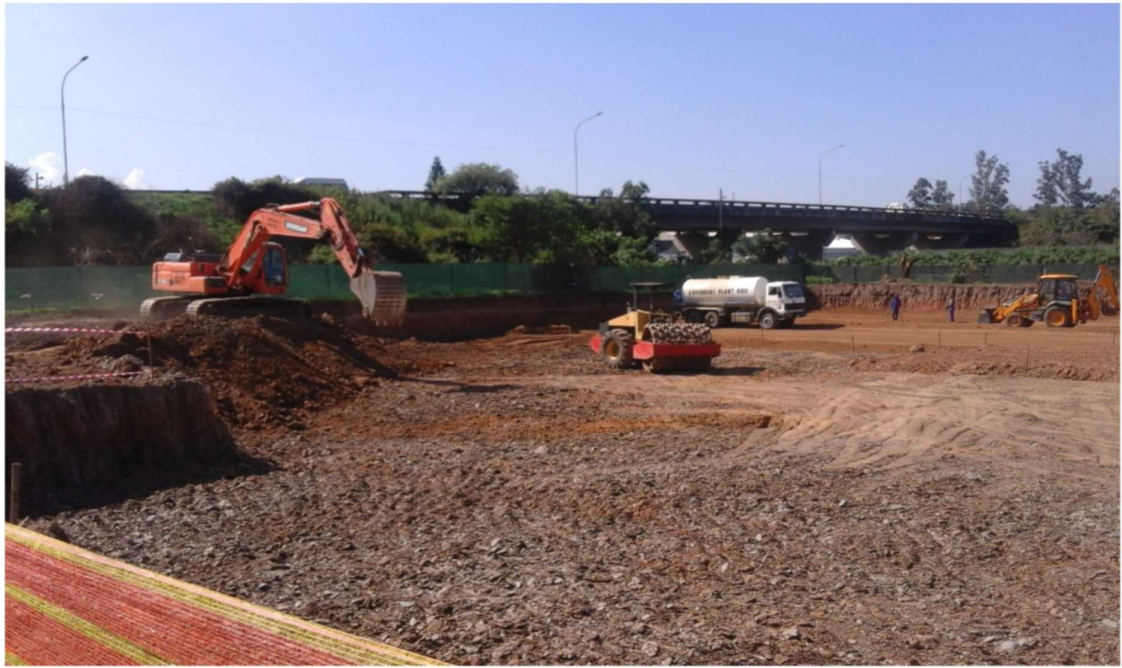
Figure 6 Excavation at Jika Joe