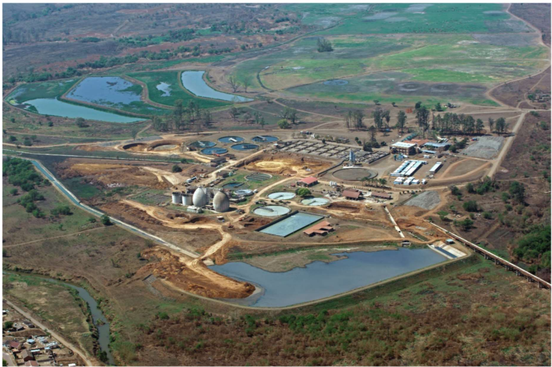
Figure 1 Ariel view construction site Darvil -Bulk earthworks excavation 150000m3 completed

To build long term relationships with our customers, taking the time to understand the needs of the customer and providing appropriate and suitable earthworks and civil construction, in response to those needs, in South Africa and expanding into the Southern African Region.