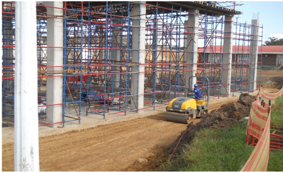
Figure 4 Backfilling and compaction around structures- Darvil