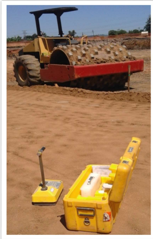
Figure 8 Soil testing at Jika Joe