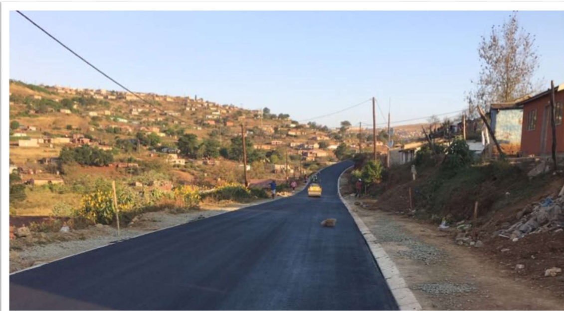
Figure 12 Asphalt Kwa Pata

Address: 26 Pentrich Road, Pietermaritzburg