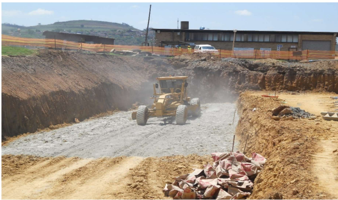
Figure 3 Stabilizing of earthworks, aerobic reactor Darvil

Address: 26 Pentrich Road, Pietermaritzburg